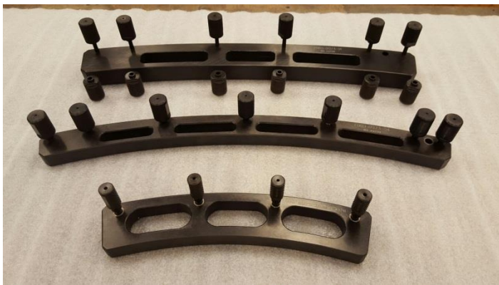
True Position Gages