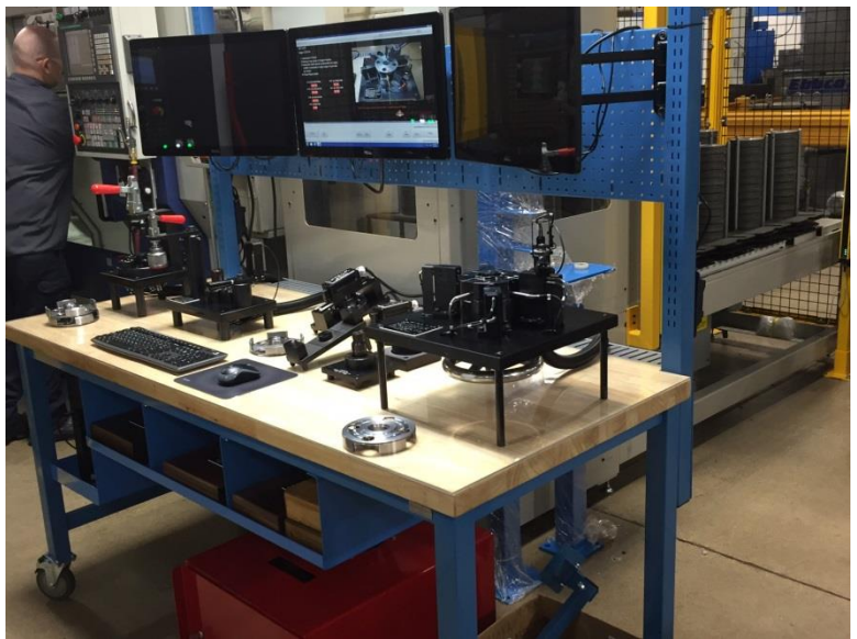
Turn Key Solutions